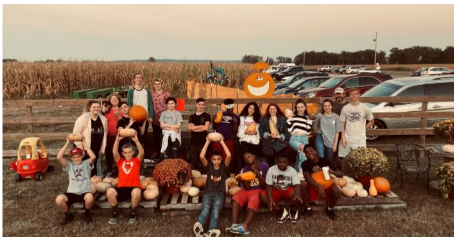
This past month the Youth took a trip to the Corn Maze in Mayflower!