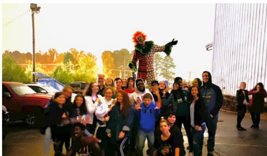
The Youth made it clear they wanted to do a haunted house ....and they showed up! We took 27 kids!

A: "I will be your God and you will be my people." "You are wonderfully and fearfully made."