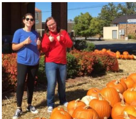
Estimated Pumpkin Patch SALES = $5,500