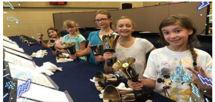
NLRFUMC participants in Xtreme Ring.