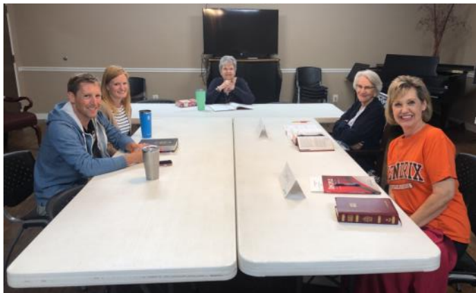
Members of our Wed. Night Disciple Fast Track 1 Class.