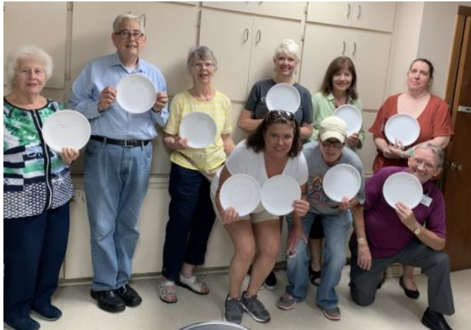
These are members of our Sunday afternoon class If You Want to Walk on Water, You Have to Get Out of the Boat.