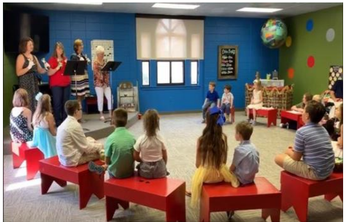
JuBELLation Ringers giving a demonstration prior to the Xtreme Ring event.